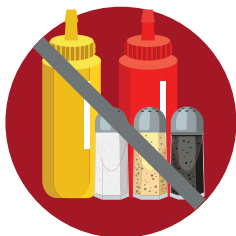
No Condiments Needed